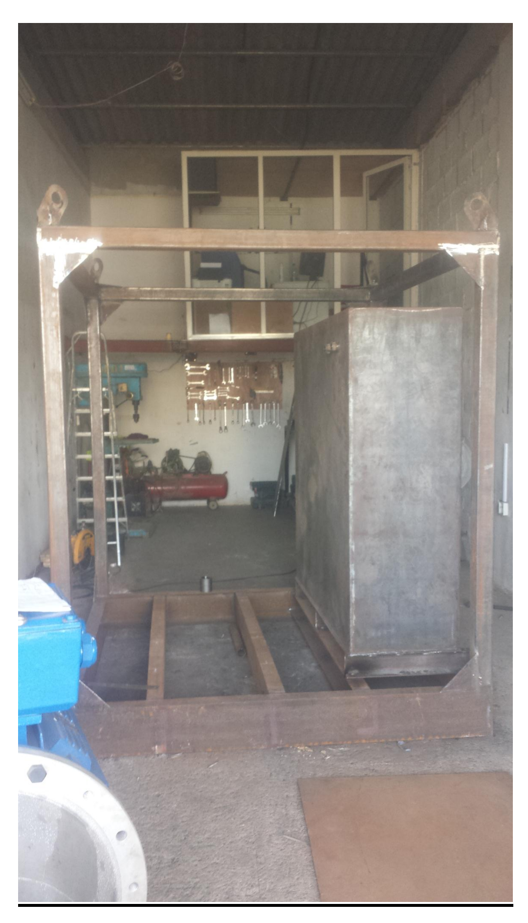
TANK WITH SKID