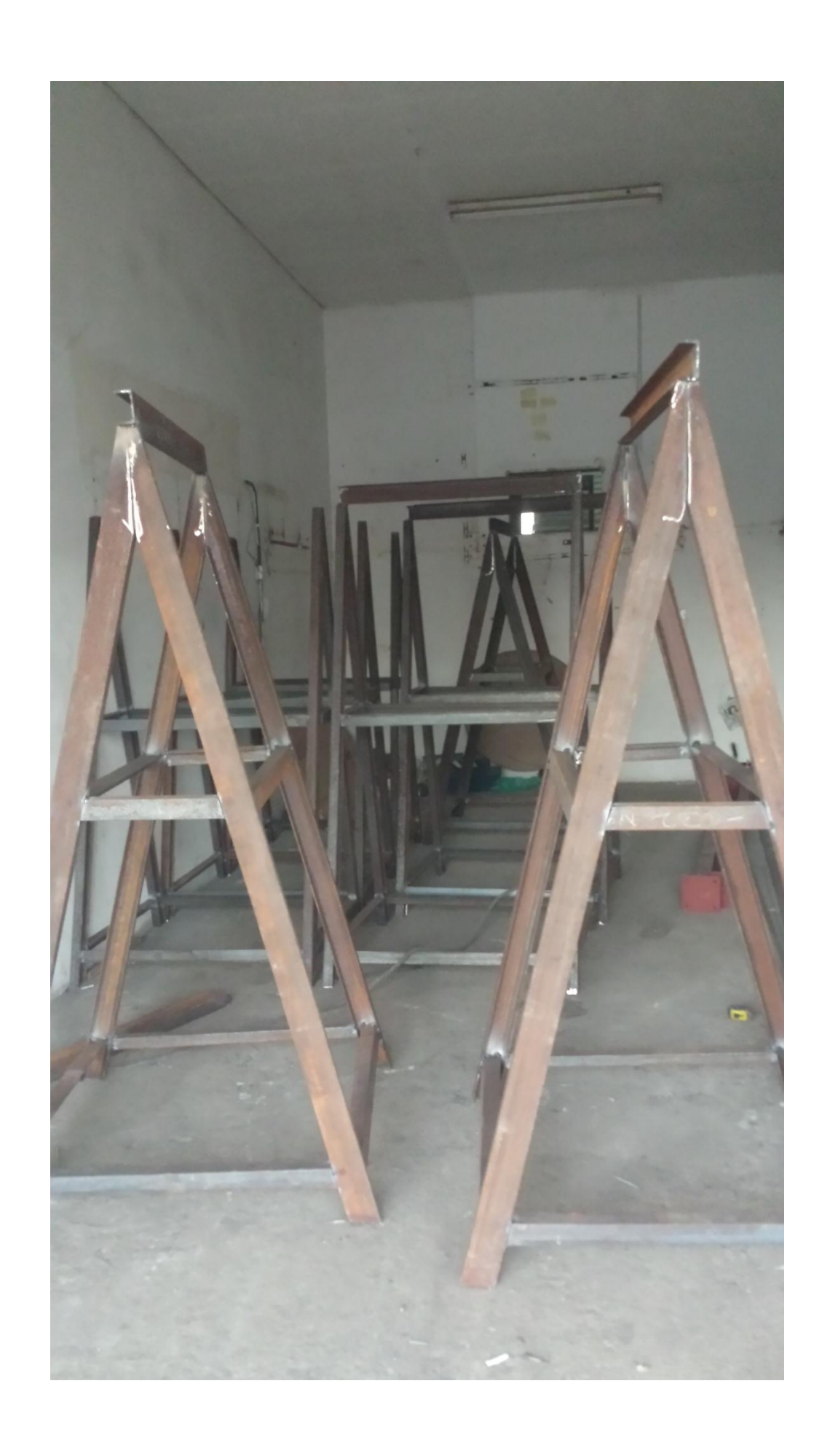
<u>A - FRAMES</u>