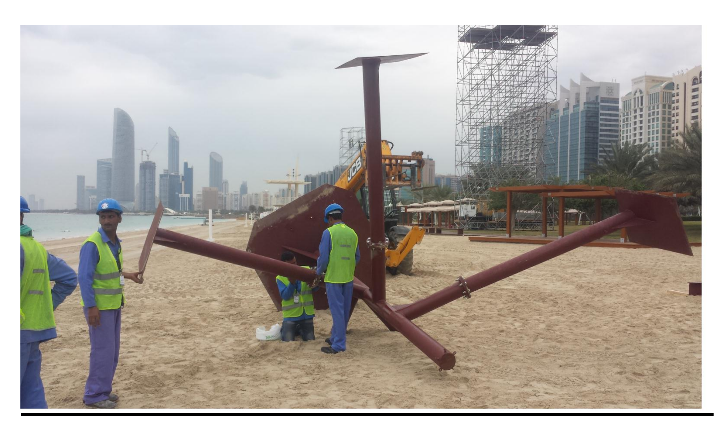
BASKET BALL SKID