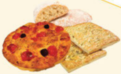
BREAD & FOCACCIA