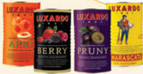
JAMS & AROMAS