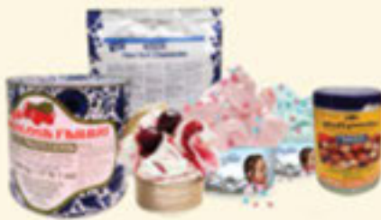
ICE CREAM MIXES