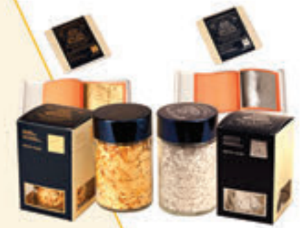
EDIBLE GOLD & SILVER