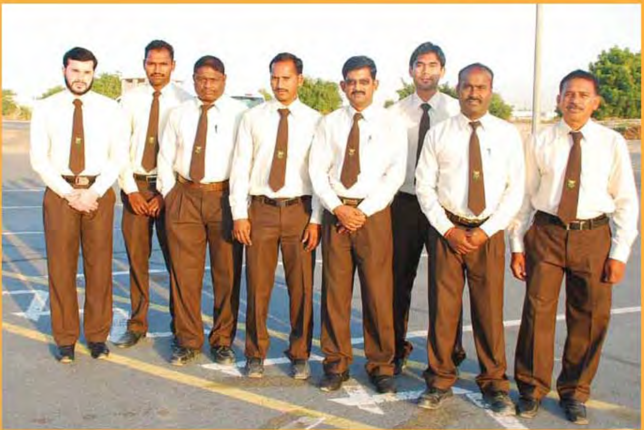
Our Male Cleaners