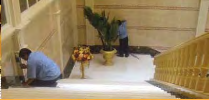
Our Dedicated Team Leaders